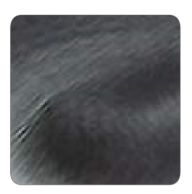
Random Swirl Stainless Steel

For lasting beauty that blends into any washroom design and will easily withstand years of use, no matter how high-volume, stainless steel is the top choice. Resistant to corrosion, rust, staining, and offering simplified maintenance, this is an ideal option for any heavily trafficked washroom. This material is available in a standard #4 brushed finish, or you may select from a number of optional textured finishes for greater durability and design appeal. This material is available in any of the four design styles.