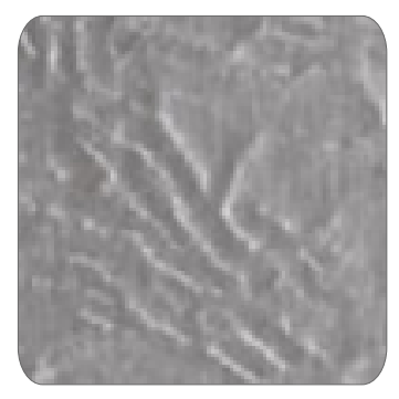
Leathergrain Texture Stainless Steel

Colors are printed representations and should only be used as a reference. Please contact us for sample color chips to be mailed. Custom color options available upon request