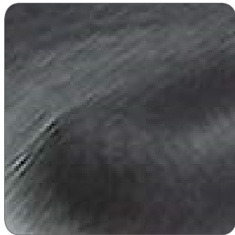
Random Swirl Stainless Steel

For lasting beauty that blends into any washroom design and will easily withstand years of use, no matter how high-volume, stainless steel is the top choice. Resistant to corrosion, rust, staining, and offering simplified maintenance, this is an ideal option for any heavily trafficked washroom. This material is available in a standard #4 brushed finish, or you may select from a number of optional textured finishes for greater durability and design appeal. This material is available in any of the four design styles.