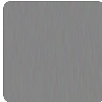
Stainless Steel #4 Finish