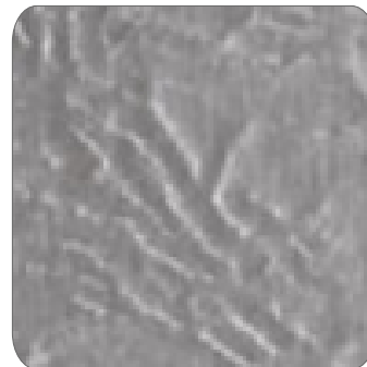
Leathergrain Texture Stainless Steel

Colors are printed representations and should only be used as a reference. Please contact us for sample color chips to be mailed. Custom color options available upon request